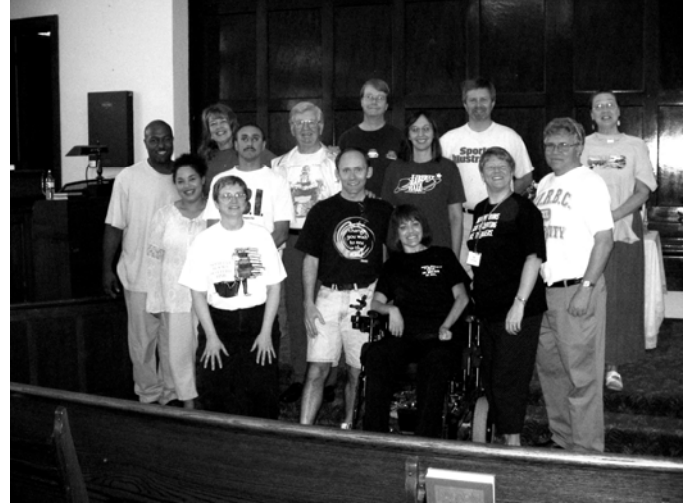
T-Shirt Sunday on June 12 th was a big hit with a variety of shirts worn by the congregation.